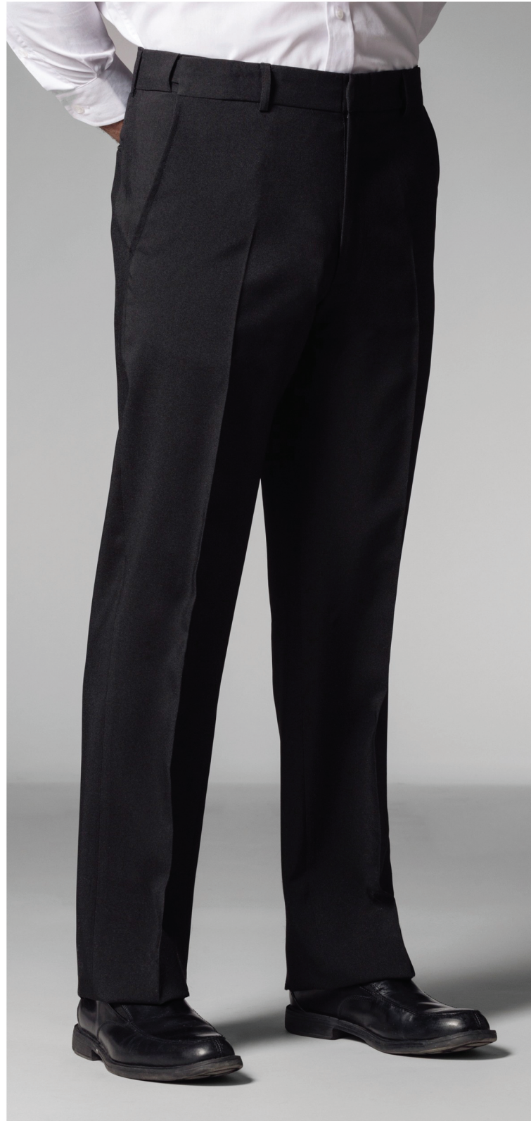
MALE EXPANDABLE WAIST PANT | Style PMBK2 Flat front, 2 pockets, 2 double welt back pockets, invisible through pocket elastic expansion, belt loops.