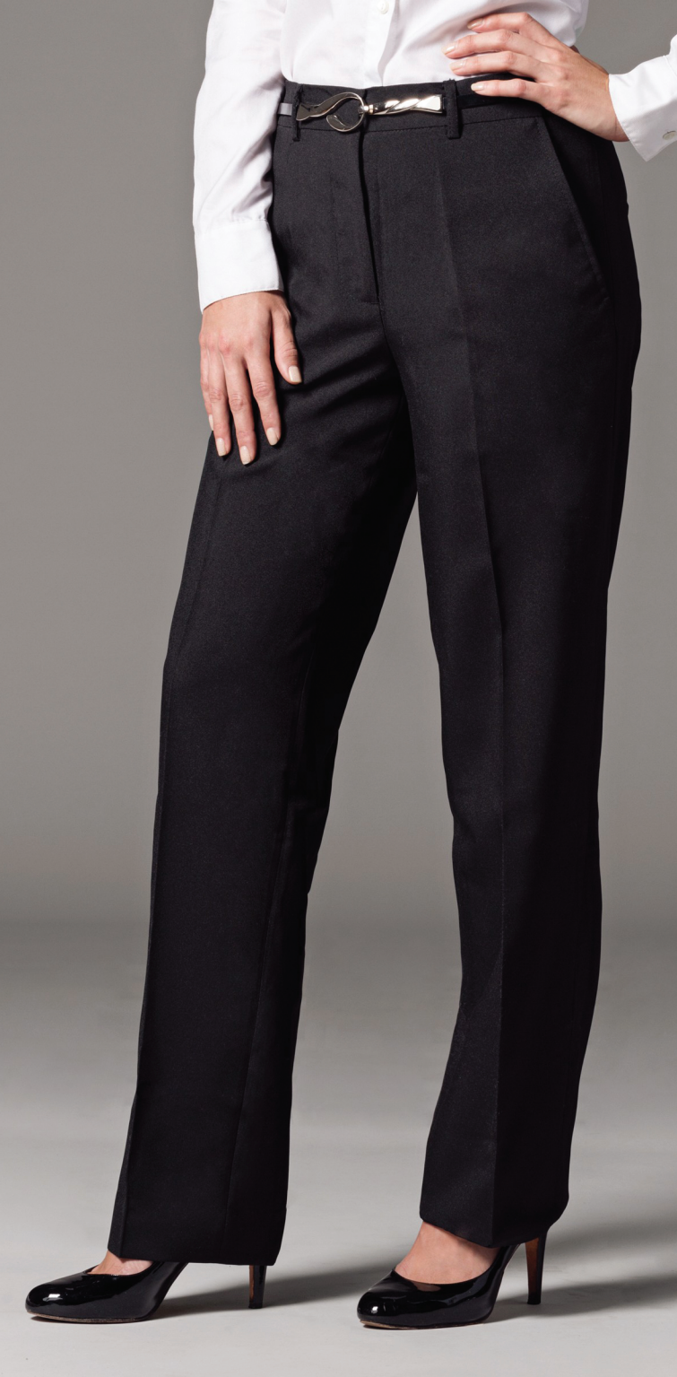
FEMALE EXPANDABLE WAIST PANT | Style PFBK1 Flat front, 2 pockets, invisible through pocket elastic expansion, belt loops.