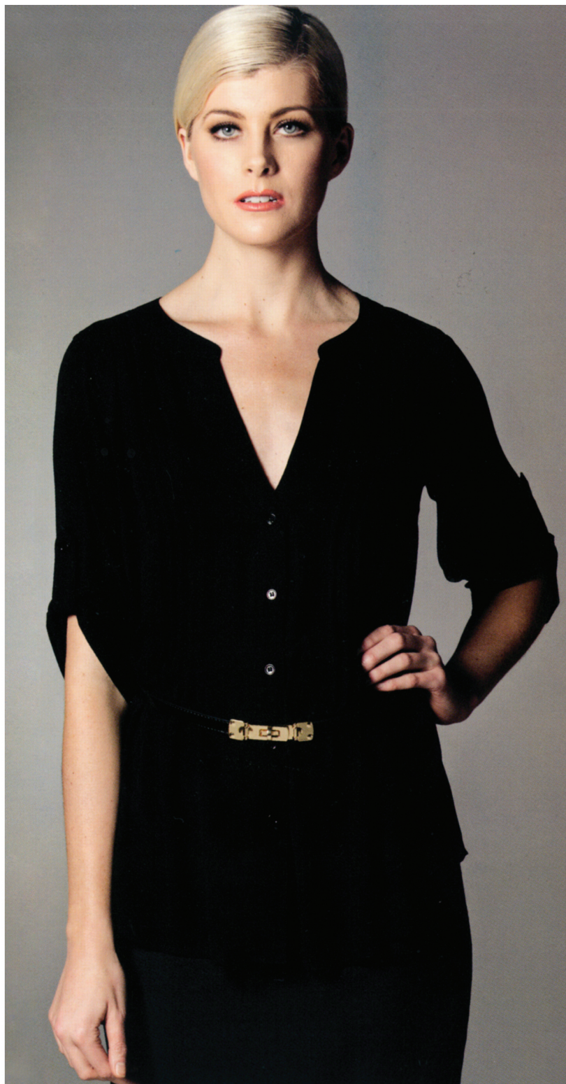
SIERRA BLOUSE | Style J30 Feminine front pleat detail with buttoned placket. Split neckline with banded collar, comfortable silhouette with 3/4 length sleeves and button sleeve tab. Made to order.